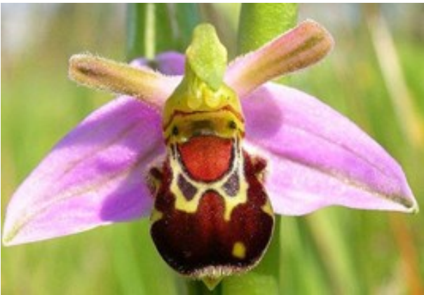
Laughing Bumble Bee Orchid (Ophrys bumblebee)