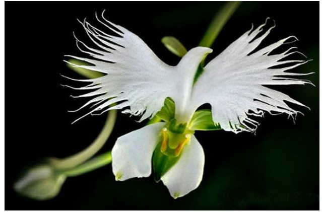
White Egret Orchid (Habenaria Raddiata)