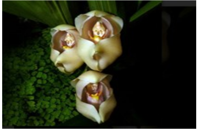
Swaddled Babies (Anguloa Uniflora)