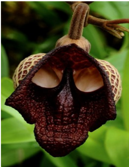
The Darth Vader (Aristolochia Salvadorensis)