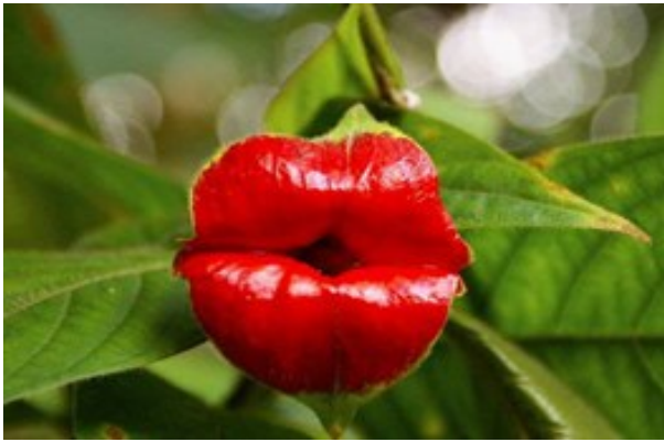
Hooker's Lips (Psychotria-Elata)