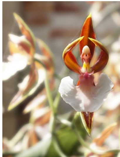
An Orchid that looks like a ballerina